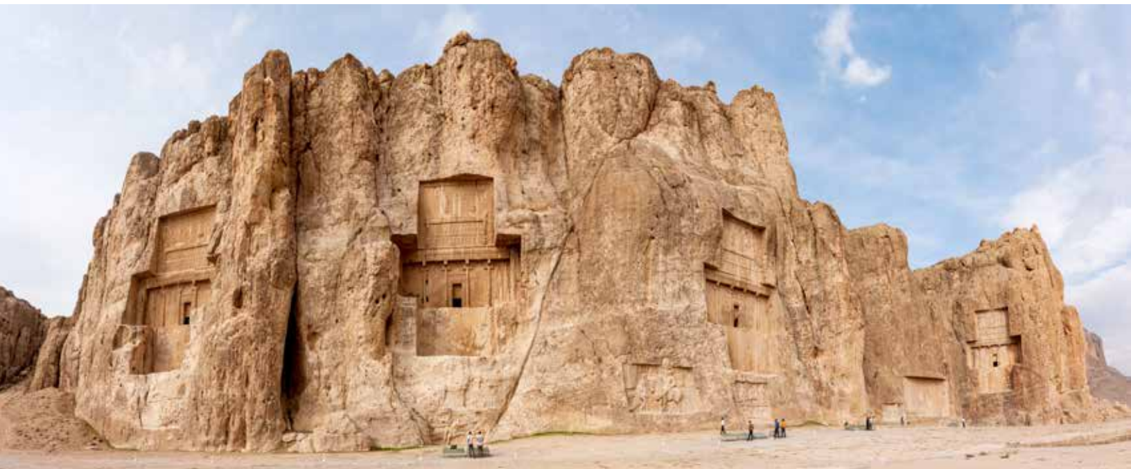
Naqsh-e Rostam, a mausoleum of Achaemenid Persian kings located near Shiraz, Iran. From left to right, tombs of Darius II, Artaxerxes I, Darius the Great, Xerxes I.

According to Herodotus, the Persian tribes were: the Pasargadae,