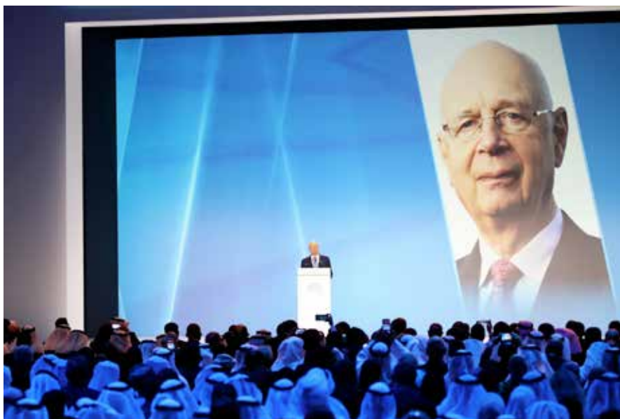
Klaus Schwab, WEF founder and chairman, delivers a speech at the 2023 World Government Summit in Dubai.

The other major leader of the Forum is George Soros. Soros also has a potentially troubling Fascist