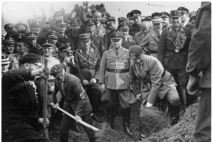
Hitler at a groundbreaking for a new section of highway. The Nazi Party greatly increased social programs, resorting even to slave labor for the benefit of the state.

2 Thessalonians 3:10, “For even when we were with you, we commanded you this: If anyone will not work, neither shall he eat.” (NKJV)