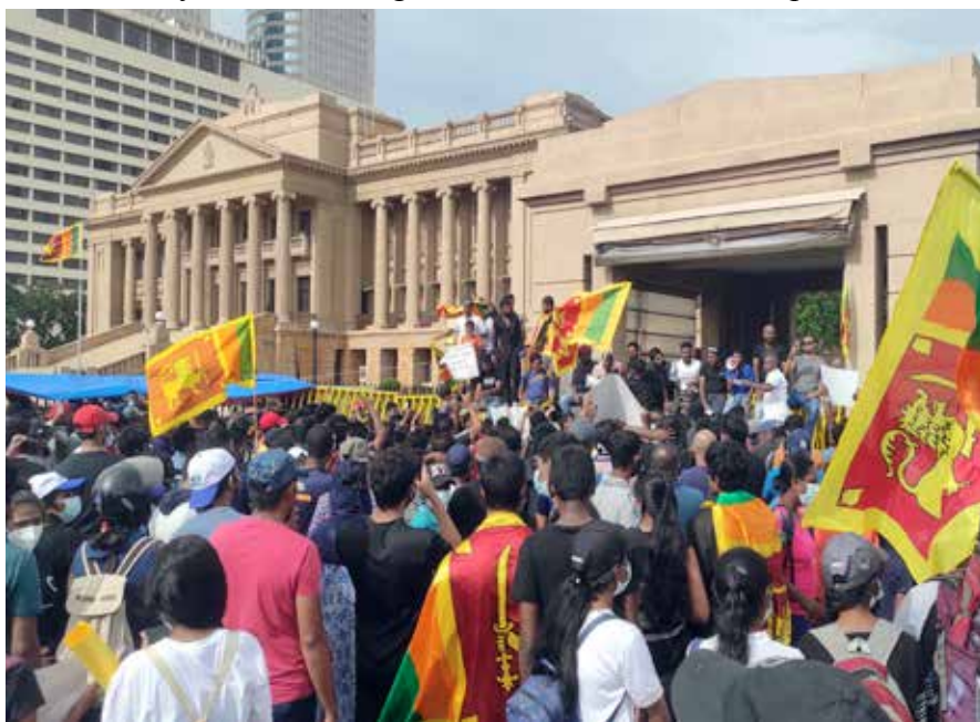
Conditions in Sri Lanka deteriorated until angry mobs overran the government in 2022. The economic crisis is still ongoing.

If you haven't heard a Trump speech lately, it'll do you good. Now he claims to know who is who, something he clearly didn't in his first term. The bigwigs in power now can't let him come back, so they've charged him with crimes. Not that they didn't before, but the guys who prosecuted those supposed misdeeds have slipped into obscurity. Now they've got new guys, no doubt with great reputations and accomplishments, to fall on their swords. After, that is, they've got the images they so desperately want, circulated at just the right time. Now they can't afford to miss. The country might be saved, and that's not on the agenda. □