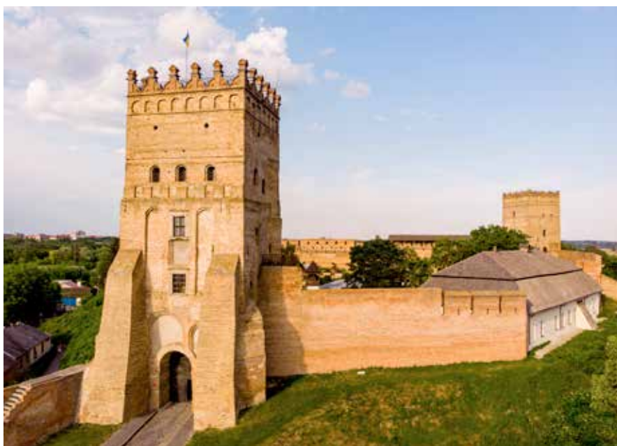
Lubart's Castle, or Lutsk Castle, built in the 14th century, was named for the last ruler of united Galicia-Volhynia, Liubartas.